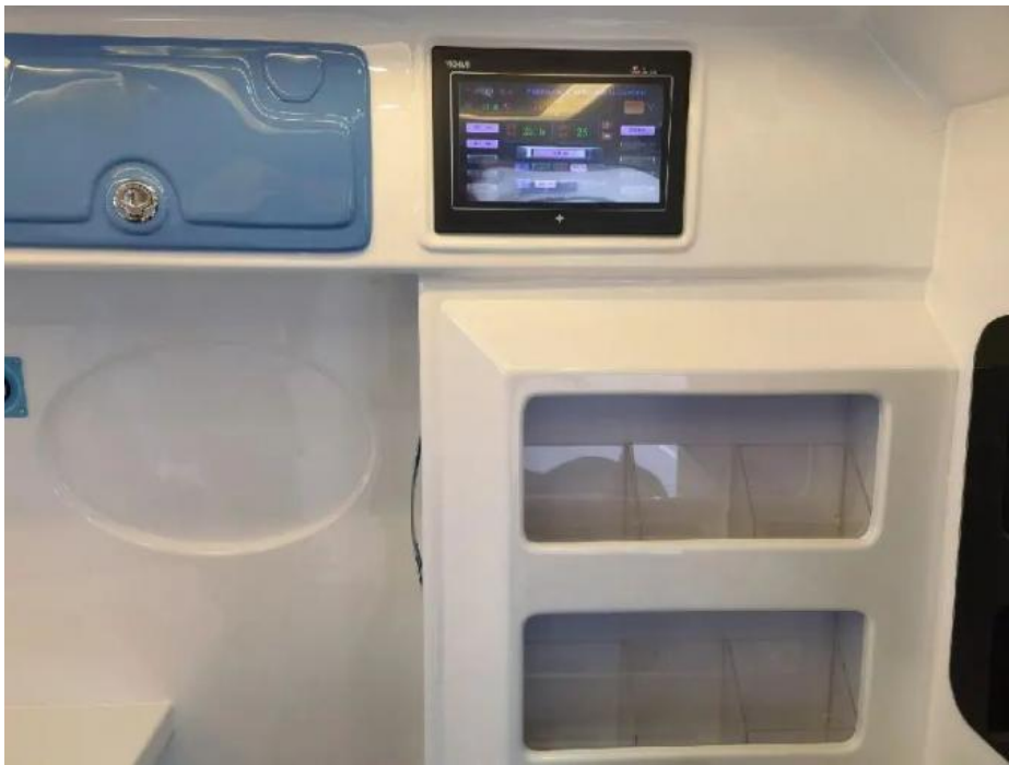
2024 Brand New Ambulance Van Transit Medical Hospital Ambulance Vehicle for Sale