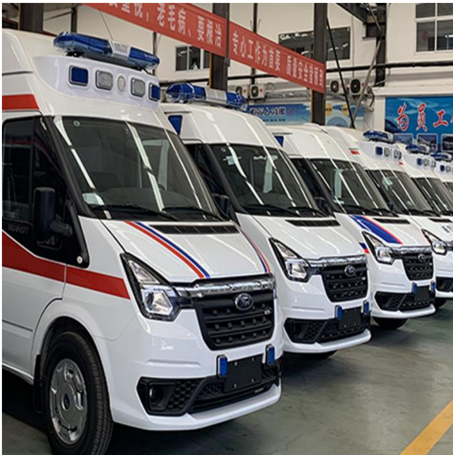
ICU Ambulance Portable First Aid Emergency Ventilator Transport Ventilators with oxygen cylinder medical ventilator