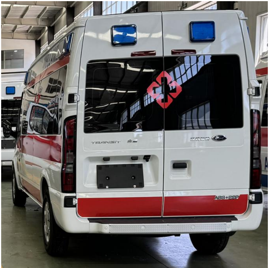
Professional Emergency Ambulance wheelchair stretcher