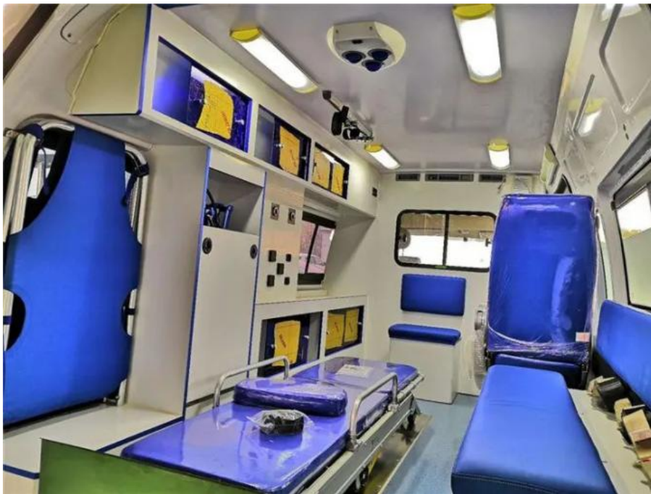
Factory Wholesale Foldable Clinic Hospital Emergency Ambulance Patient Transport Stretcher Trolley Medige