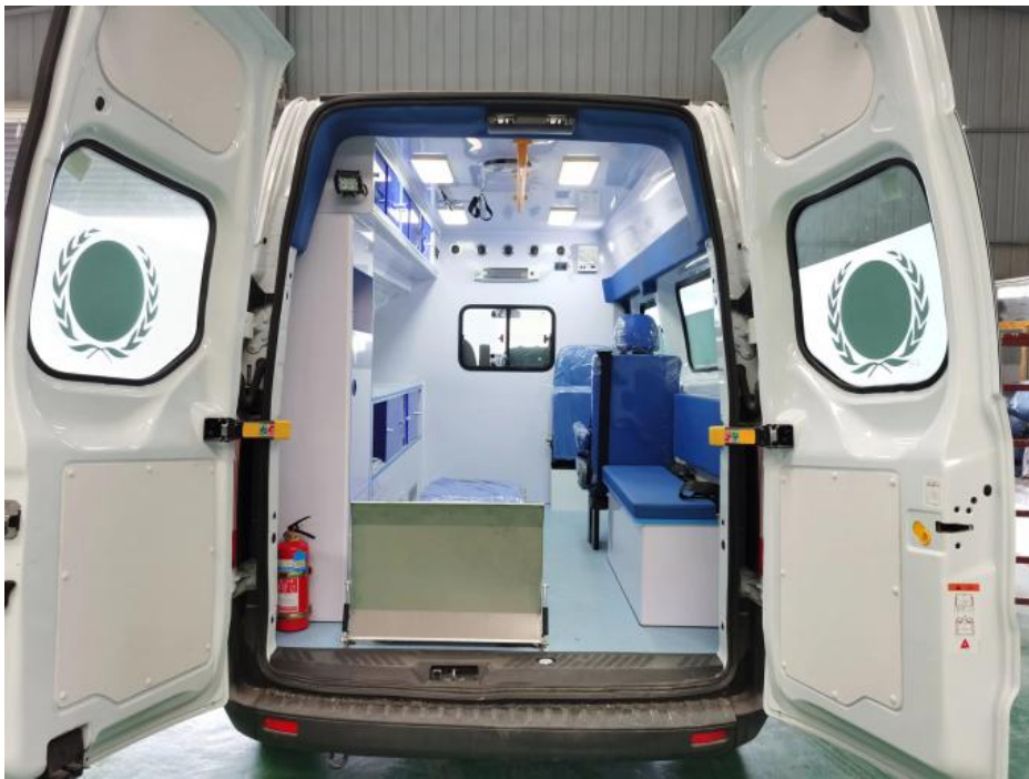
Ambulance Wholesale Medical Aluminum Ambulance Trolley Stretcher Patient Transfer Stretcher Bed