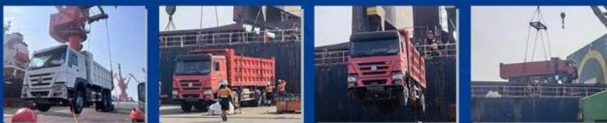
Self dumping truck and miscellaneous ship lifting