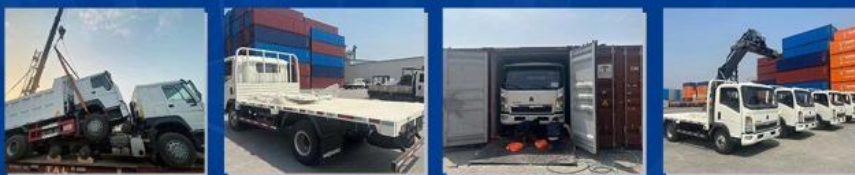
Light truck containerized transportation