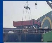
Self dumping truck and miscellaneous ship lifting