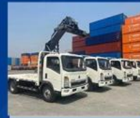
Light truck containerized transportation