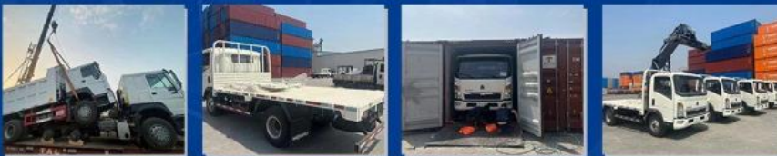
Light truck containerized transportation