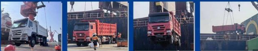
Self dumping truck and miscellaneous ship lifting